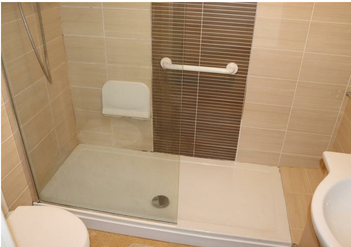
Modern Shower Room