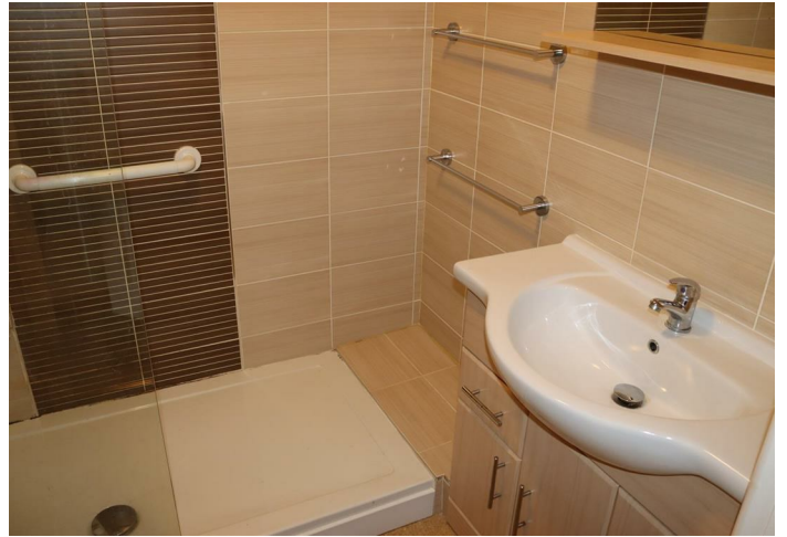
Modern Shower Room